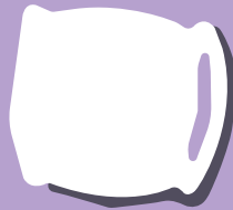
Sufficient time to relax and sleep

Try and avoid screens completely for children under 3.