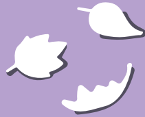
Physical activity and time outdoors